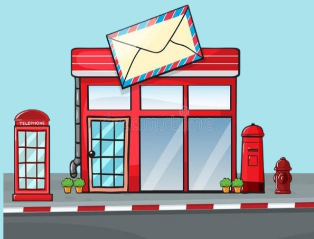
World Post Day